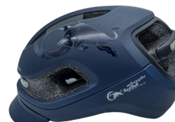
Stromer 2.0 Smart Helmet with Magentic Visor